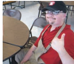
b. pretty good day

Which one do you think means “pretty” like “sort of” or “kind of”?