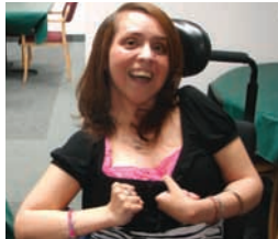
a. pretty girl

This story talks about a pretty girl and a pretty good day. Which one do you think means “pretty” like “beautiful”?