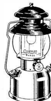
Model 202 (Discontinued)