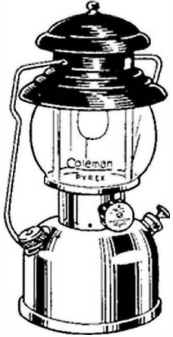
Model 200, 200A