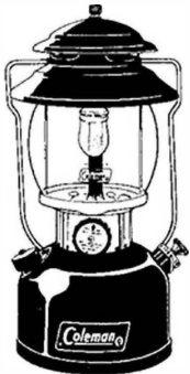
New Model 200A