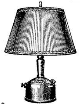
Model 139 (Discontinued)