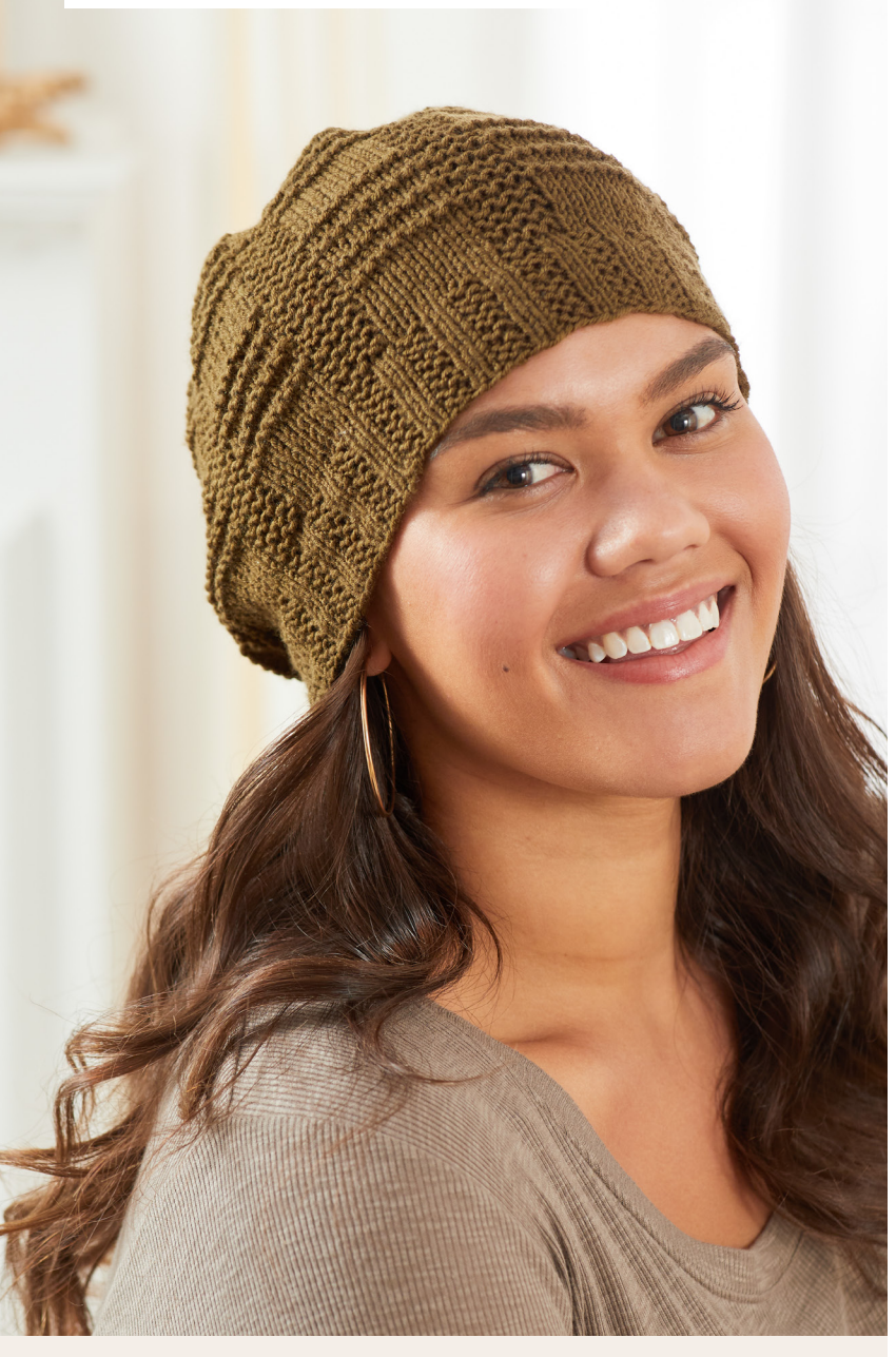
Garter Stripes Hat