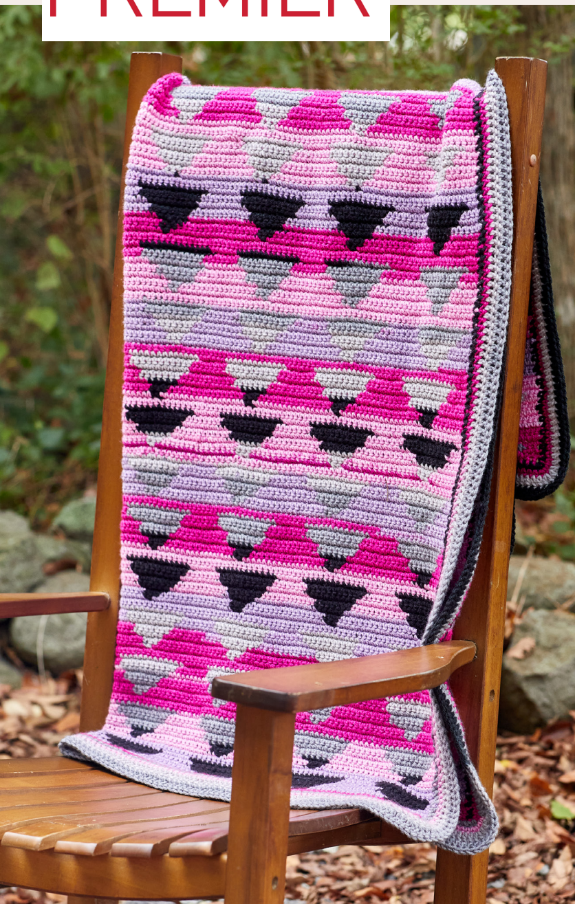
Triangle Fusion Blanket