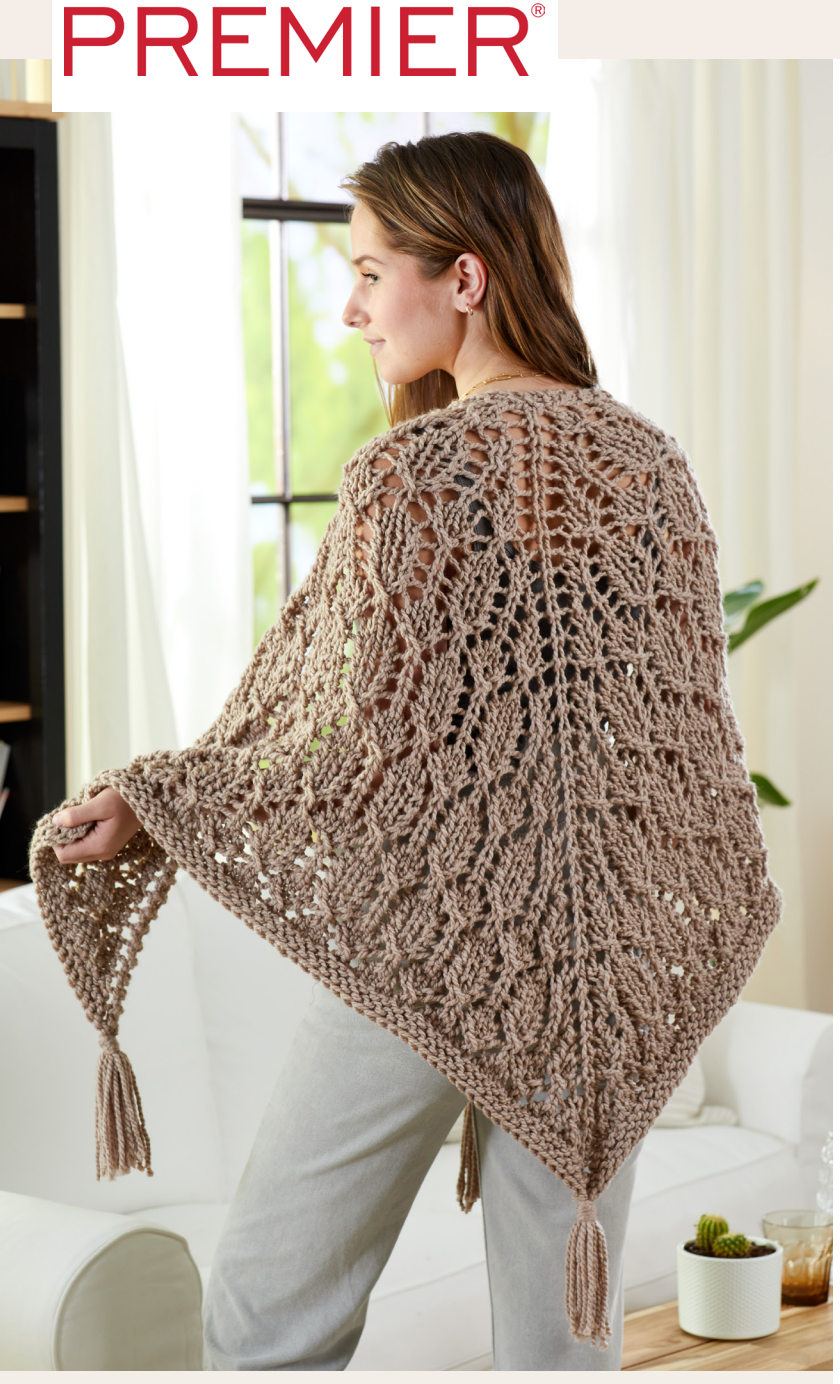
Spider Lace Shawl