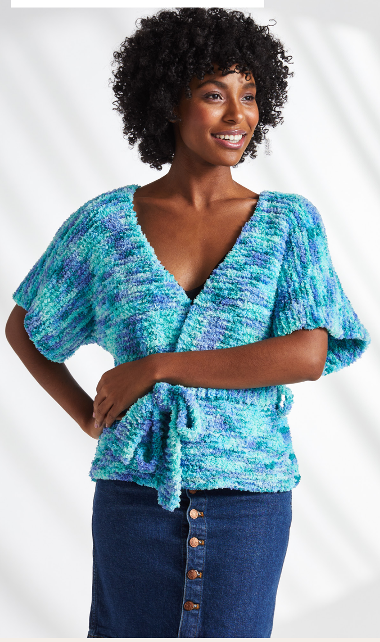
Garter Stitch Cardigan