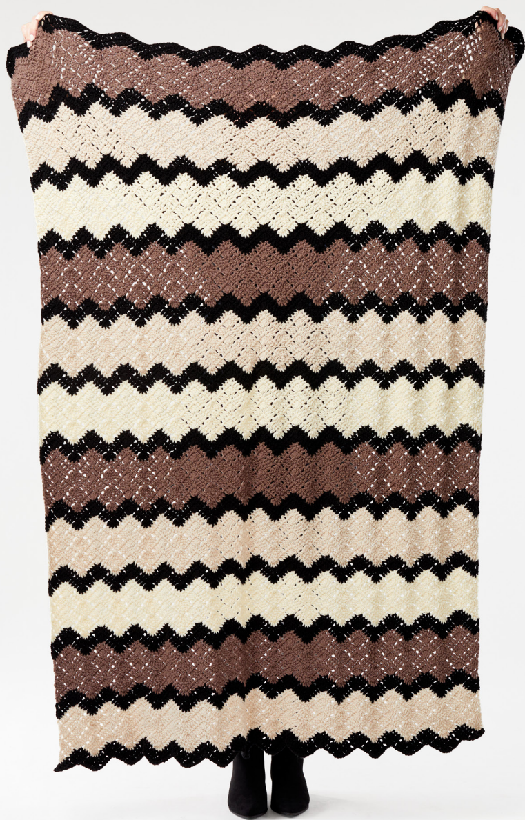
Fudge Ripple Throw