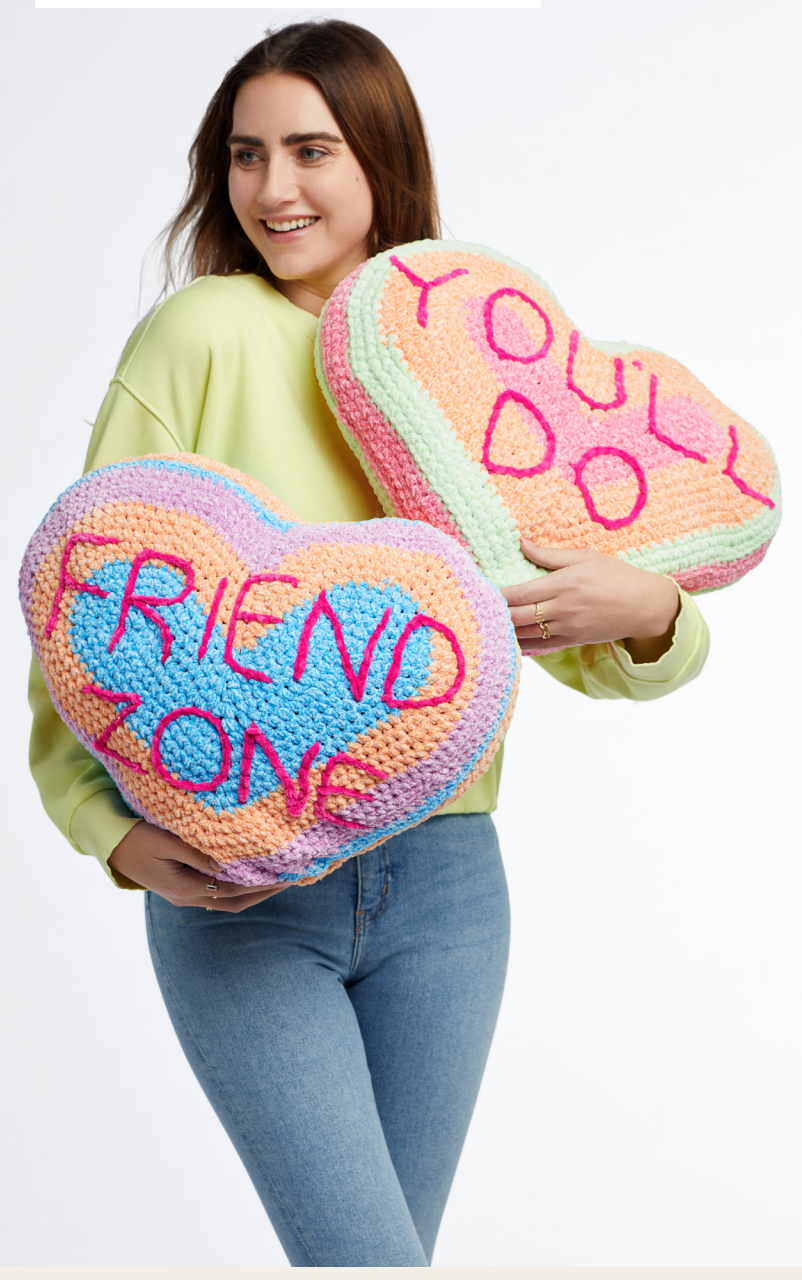
Talking Hearts Pillows