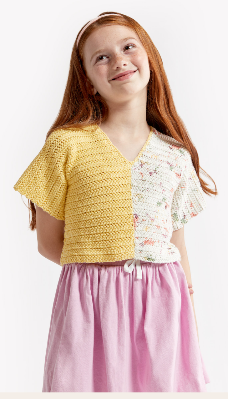
Kids Two-Tone Tee