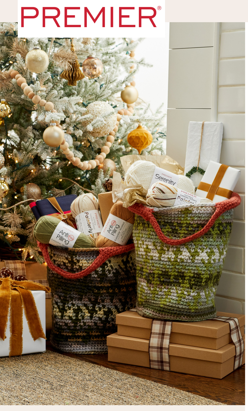
Tapestry Leaf Baskets