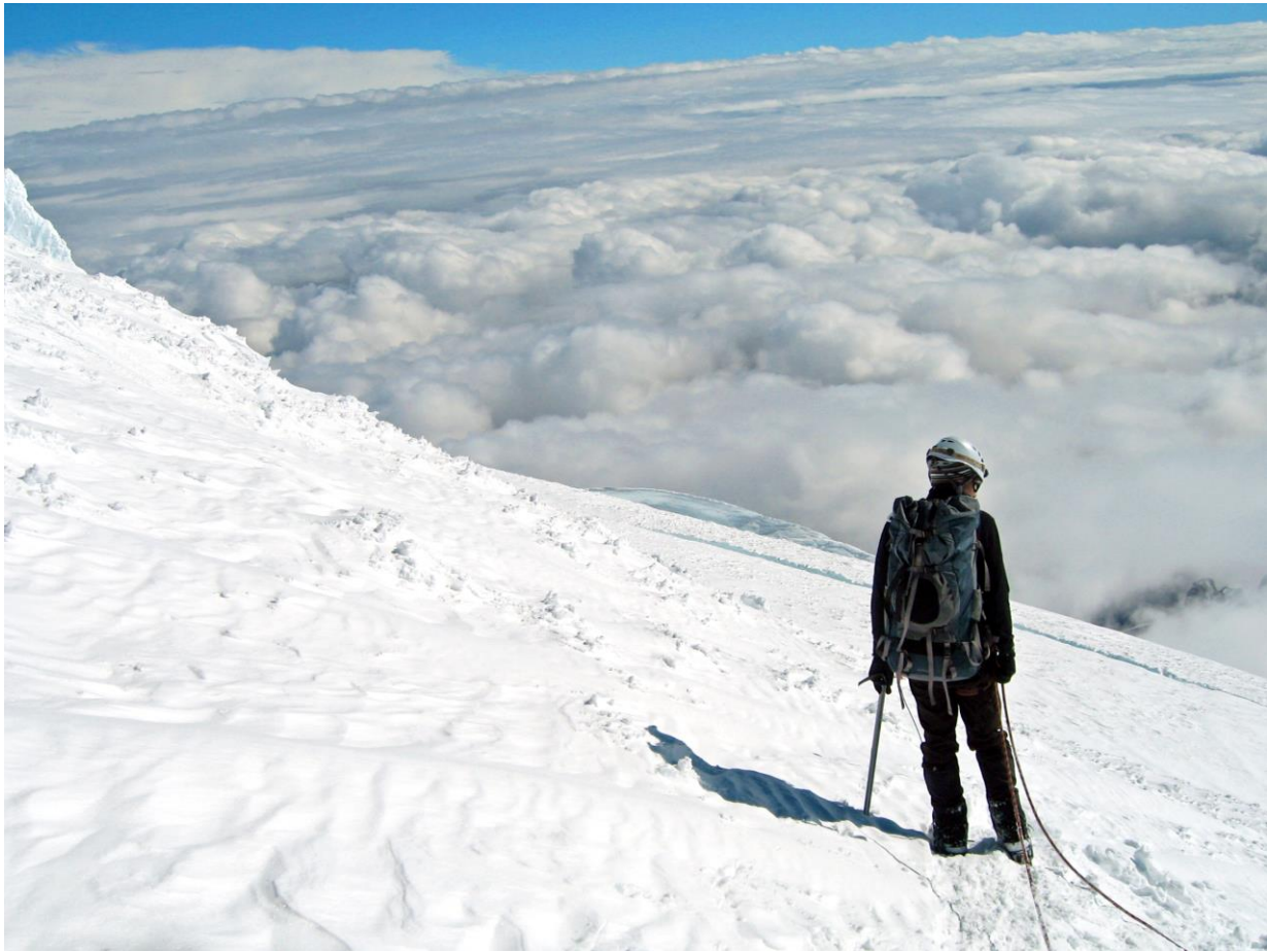
Kent stands below the summit of Mt. Rainier in Washington, USA.