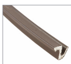
Frame Perimeter Seal (AQ21B) brown, also available in white