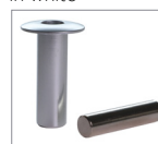
Magnetic Door Stop for Pivot Door (FANTOM/S)

View our full range of accessories on page 136