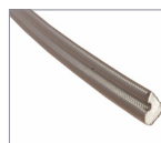
Door Perimeter Seal (AG63B) brown, also available in white