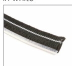
Track Seal in Black (BS10B)