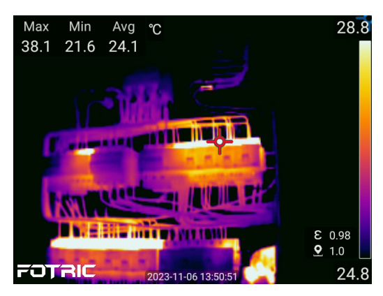
40mk thermal sensitivity reveal every anomaly