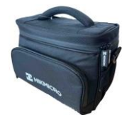
M/G/SP Series Pouch HM-SP01-POUCH

COMPLIANCE NOTICE: The thermal series products might be subject to export controls in various countries or regions, including without limitation, the United States, European Union, United Kingdom and/or other member countries of the Wassenaar Arrangement. Please consult your professional legal or compliance expert or local government authorities for any necessary export license requirements if you intend to transfer, export, re-export the thermal series products between different countries.