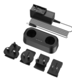
M Series Charging Base HM-5202ZC