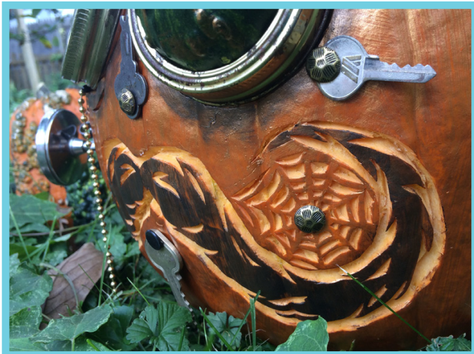
thumbtacks & keys