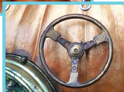
toy steering wheel