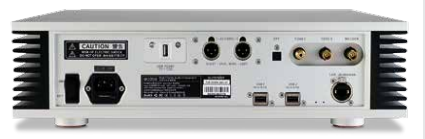
ABOVE: An isolated Gigabit Ethernet port [lower right] is joined by two USB-A 3.0 hubs for outboard drives and an external word clock input. Outputs are on USB-A 2.0 (384kHz/32-bit; DSD512), Dual-AES (DSD128 over DoP) and coax/opt (192kHz/24-bit)

is the only determinant of sound quality in such a set-up. Indeed, as PM's Lab Report [opposite] shows, the W20SE potentially brings more to the party with lesser DACs, while also proving an excellent source with high-end converters.