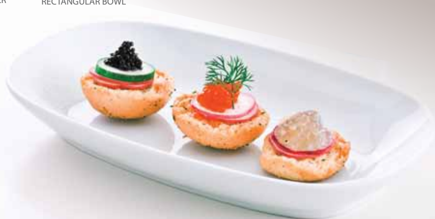
SALT &amp; PEPPER