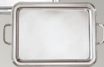
20. 'AVENUE' RECTANGULAR TRAY