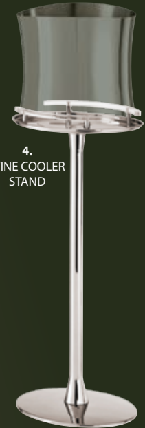
4. WINE COOLER STAND