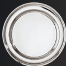
20. ROUND PLATTER