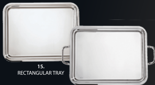
15. RECTANGULAR TRAY