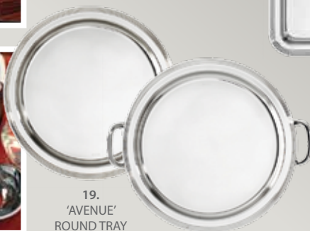
19. 'AVENUE' ROUND TRAY