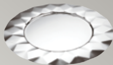
15. 'MALIA' SHOW PLATE