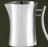
5. WATER PITCHER