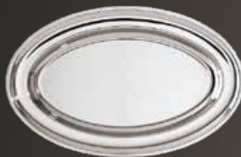
21. OVAL PLATTER