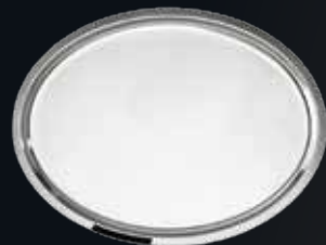
19. OVAL TRAY