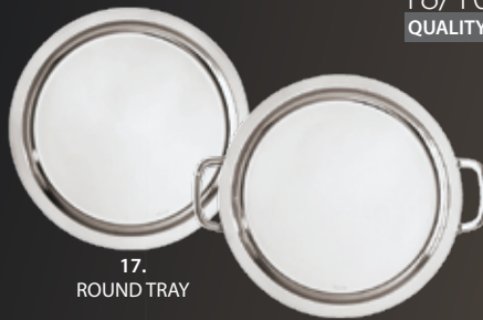
17. ROUND TRAY