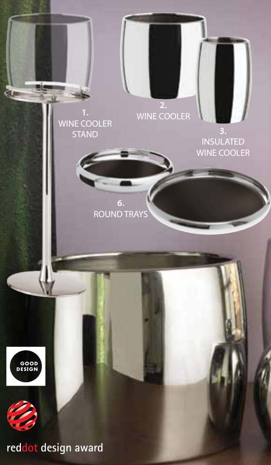
1. WINE COOLER STAND