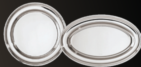
10. ROUND PLATTER