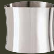
1. INSULATED WINE COOLER