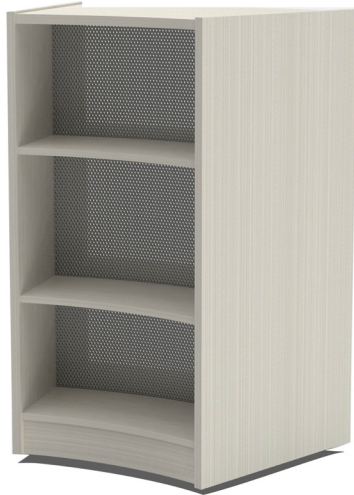
Radiused Unit with Optional Steel Back