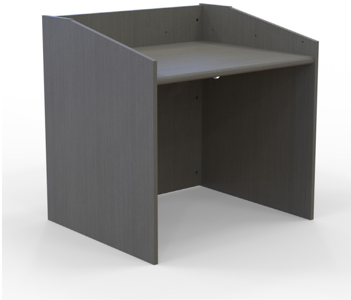
360 Style Carrel