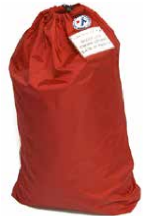
MED-LRG COVERS COME WITH BAGS