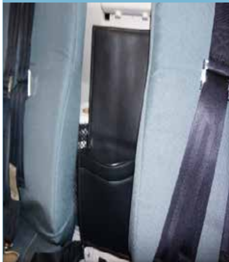
BLACK CENTER POCKET