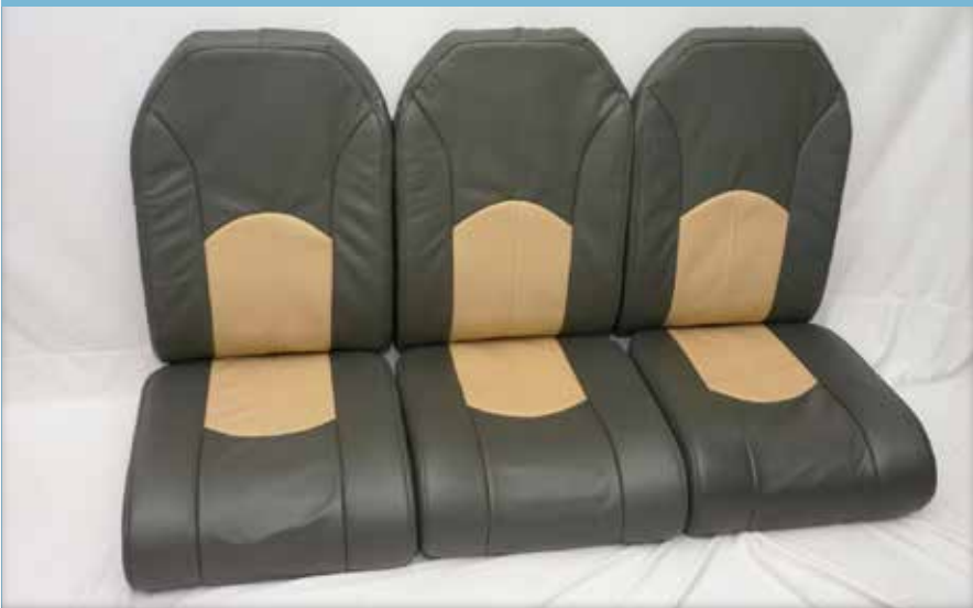
BELL 206B PASSENGER SEATS