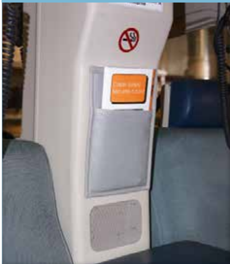
GREY SMALL MAP POUCH