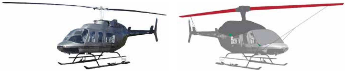
WINTER COVERS FOR BELL 206L