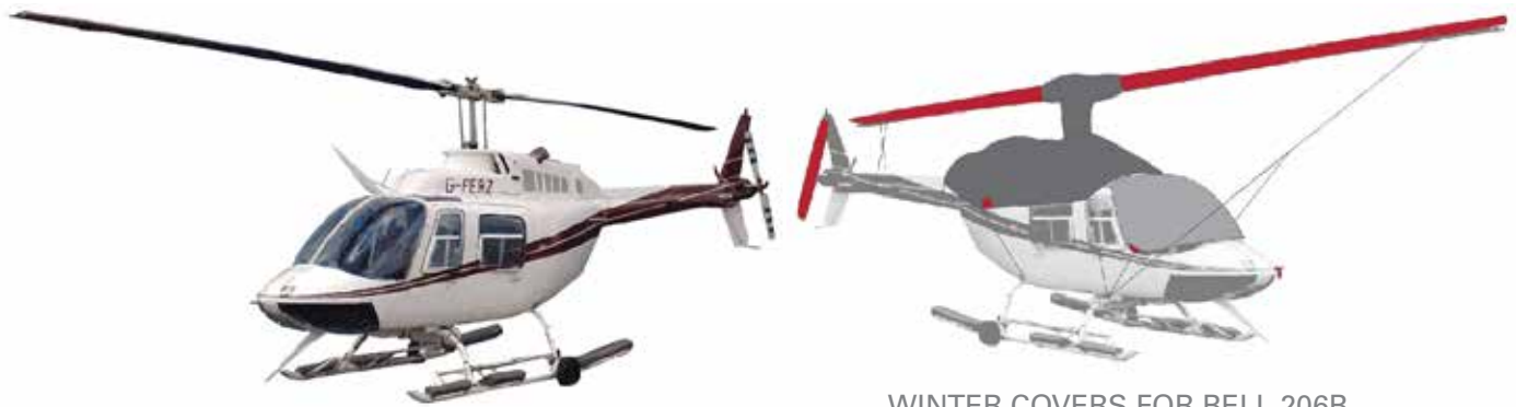
WINTER COVERS FOR BELL 206B