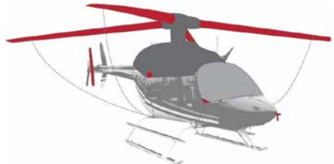
WINTER COVERS FOR BELL 407