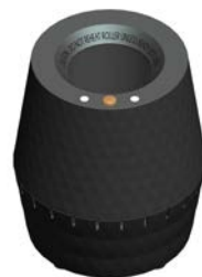
HEATER BASE (FRONT)