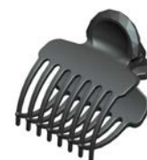
ROLLER & WIRE CLIPS DESIGNED SPECIFICALLY FOR INDUCTION HOT ROLLERS