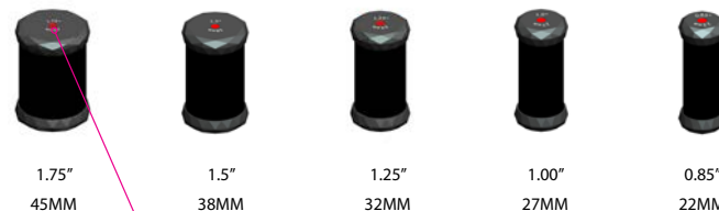
HOT ROLLERS DESIGNED FOR MAXIMUM INDUCTION PERFORMANCE

WHEN ROLLER IS READY FOR USE, THE READY DOT CHANGES FROM RED TO WHITE