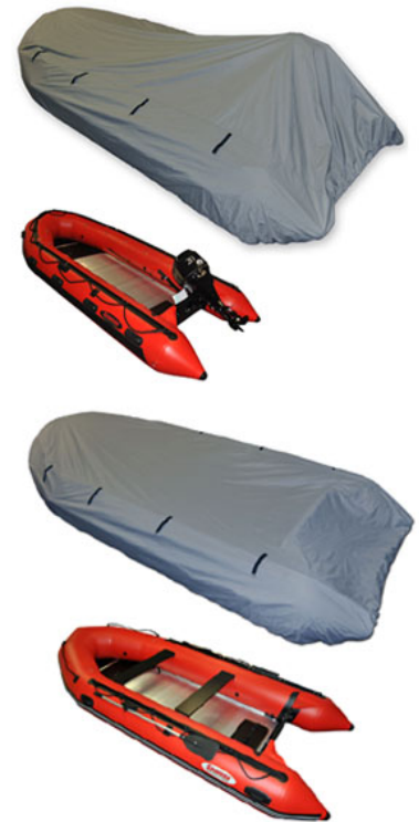
For Showing the Cover Only