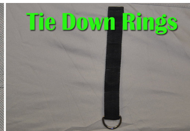
Tie Down Rings