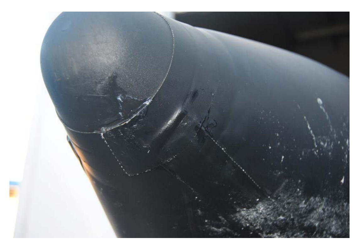
NOTE: Seamax can provide: PVC Glue with Glue hardener (total 100ML), MEK in a small container (50ML), Acetone (50ML), Glue injection needle. Extra material should be able to find from local store like homedepot or Canadian tire. MEK & Acetone can be purchased from local painting store. Please know all above items are belong to dangerous goods, we can only ship with small amount for one time boat repair using (except local pickup).