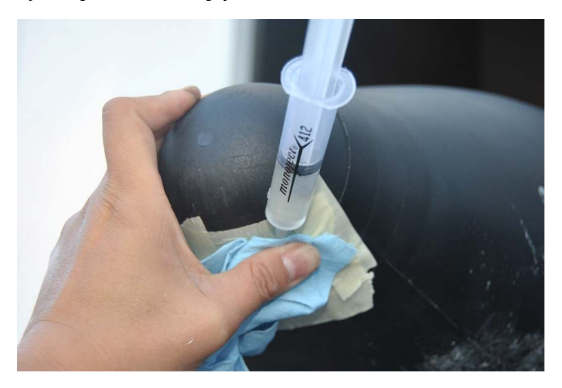
Done and leave it dry for 48 hours, inspect the result and make sure all fixed.