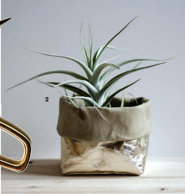
1. These 14-karat-gold-plated Italian scissors look sharp in a desk or crafting table caddy. $30-$46. blancheandmimi.com 2. Style is in Uashmama's washable Metallic Platino paper bag , ideal as a catchall or plant pot. $16. minkahome.com 3. Raise your glasses (or play tic-tac-toe) on fruitsuper's sleek Lift coasters , $68 for 4. urban-dwell.com 4. Honeycomb Studio's porcelain-and-22-karat-gold Minimalist jewelry dish lets your baubles shine. $16. becomingjewelry.com 5. Visual Comfort & Co.'s gilded-iron Studio Martini table provides a sculptural cocktail perch. $385. fogglighting.com 6. Inspired by experiments plunging lit bulbs into paint, Marset's Dipping Light offers a colorful take on mood lighting. $295. chiltons.com 7. Boho meets metallic on John Robshaw's Moheti Euro pillow — a showstopper on any sofa. $175. margomoore.com