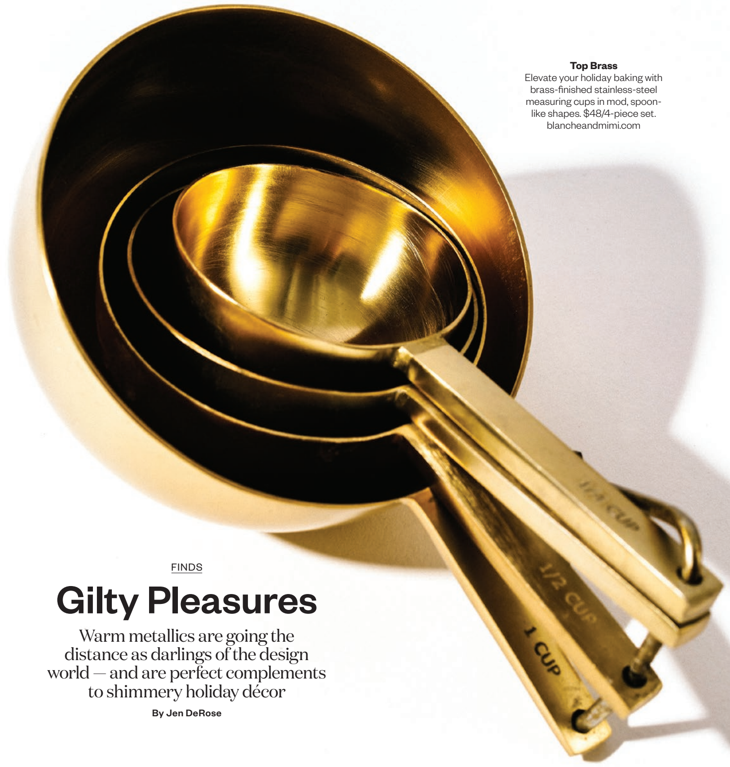
Top Brass Elevate your holiday baking with brass-finished stainless-steel measuring cups in mod, spoon-like shapes. $48/4-piece set. blancheandmimi.com