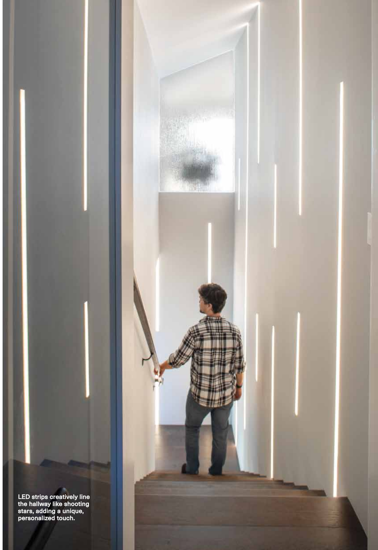
LED strips creatively line the hallway like shooting stars, adding a unique, personalized touch.