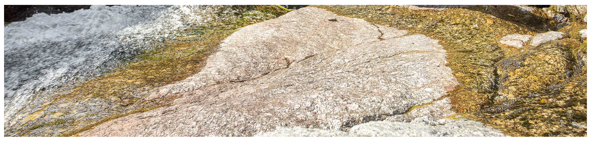
Sat overlooking the basin of Gullu waterfall.

For over an hour we trace a trail carved out alongside a protruding water pipe that supplies the surrounding residence with fr water, before the sights and sounds of the Gallu Devi waterfall reveals itself behind the wall of deodar trees. A woven line dee mountainside into a deep turquoise basin that lies before us, where perched atop a boulder we find a moment of solitude as evolving clouds above us.