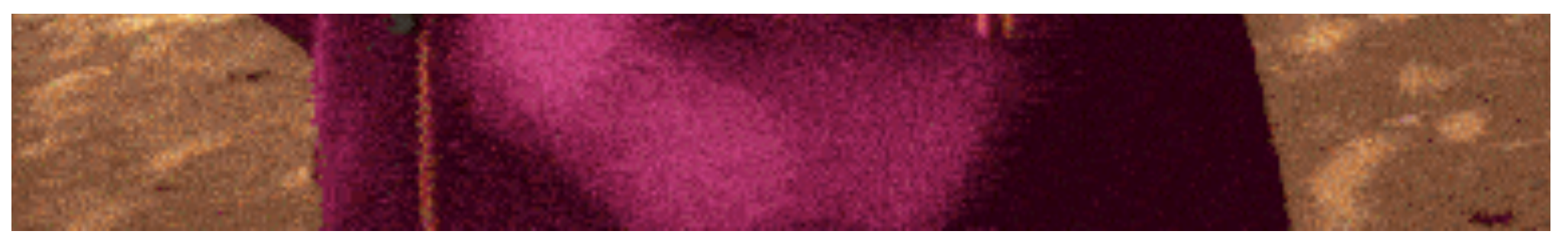
'Pit zips' enable airflow inside the jacket to prevent you from over heating

For the last couple of months the Misti has been my go-to, and so far I haven't found a single flaw. My favourite aspect of the ability to adapt to fluctuating weather with and temperatures, whilst staying lightweight. It's the perfect accomplice for hiking running during autumn and spring.