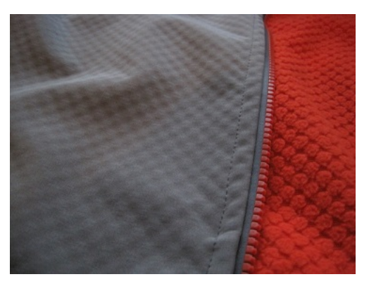
gray shell fabric and orange fleece lining

The 'Chani' outer fabric is light gray with a matte finish. All seams are water resistant seam taped in an even lighter gray. The jacket has three water-sealed bright orange outside pockets that close with YKK dual color, Aquaguard Vislon zippers: a vertical chest pocket (called Napoleon pocket) and two vertical side pockets, positioned to be accessible while climbing. The sturdy front zipper is also orange (ending in a gray fabric zipper garage at the top).