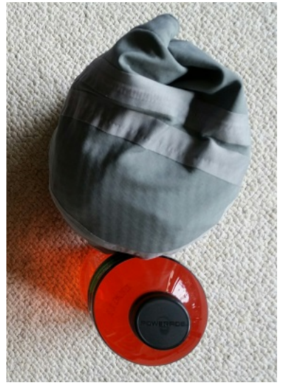
the jacket bundle diameter

The wind proof shell and its pleasant fleece liner came to great use during a recent trip to Julian, a historic gold mining town located approximately one hour east of San Diego in the Cuyamaca mountains. I had left Los Angeles in the afternoon with temperatures in the 90s F (30s C). Once I got out of the car in Julian in the evening, it was very windy and low 48 F (9 C). I pulled the Mishmi Takin 'Chani' jacket over my thin T-shirt and instantly felt warm and protected against the wind. The hood protected my head and I enjoyed strolling through the quaint small town for some window-shopping.