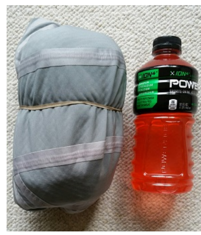
the jacket rolled into its hood

simply too hot to take the 'Chani' jacket along. As part of my Ten Essentials, I am committed to carrying insulation (extra clothing) even if no rain or other adverse weather is in the forecast. Yet I have an ultra lightweight rain jacket at 6.9 oz (196 g) that won out over the 28 oz (800 g) Mishmi Takin jacket, as I had to carry lots of water into the desert and my backpack was very heavy.