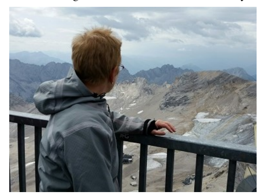
on top of the Zugspitze

I have worn the jacket every evening on my backpacking trips. Once the sun set, the temperature dropped and often a light breeze or stronger wind came up. The soft shell jacket has given me sufficient warmth to sit in camp after the sun has set and chat with my hiking buddies, feeling comfortable and well protected against the breeze or wind. On many occasions, I have pulled on the hood to keep my head warm. In fact, while I usually carry a knit hat when backpacking, during this jacket test period I have left that knit hat at home and solely relied on the warming fleece-lined hood. Even though the hood is rather big and designed to even fit over a helmet, the hood has an adjustment strap in its back plus it has an elastic cord with two tighteners in the front which allows me to tighten the circumference closer to my face.