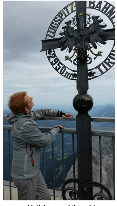
a bit tight around the waist

I really like the black stretchy fabric at the sleeve ends. I used it on top of the Zugspitze, Germany's highest mountain by inserting my thumb into the stretchy fabric that seals the sleeves tight around my wrists. We had cold 50 F (10 C) up there and the jacket kept me protected against the cold.