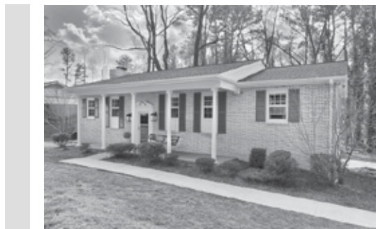
3519 Summitridge Drive SOLD $316,000