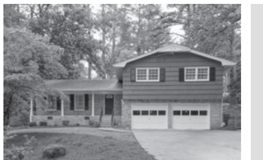
3446 Regalwoods Drive UNDER CONTRACT