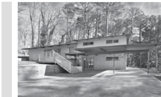
3539 Kim Court SOLD $367,500