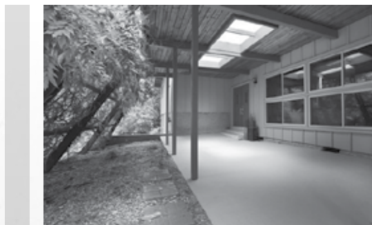
3351 Archwood Drive UNDER CONTRACT