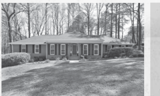
3377 Regalwoods Drive SOLD $315,000