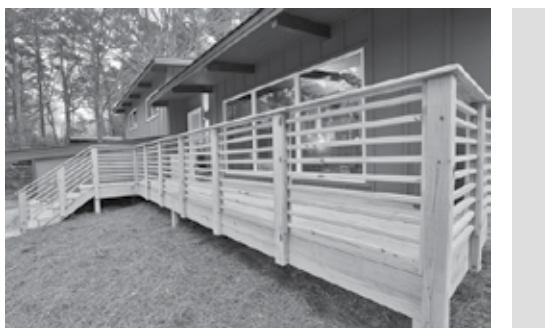
3660 Northlake Drive SOLD $350,000