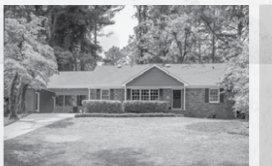
3503 Bowling Green Way SOLD $319,500

vanessa@domorealty.com C: 404.556.1733 O: 404.974.9550