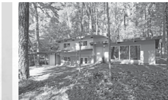
3524 Summitridge Drive SOLD $341,000