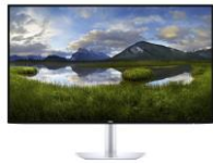
Dell 27 USB-C Ultrathin Monitor - S2719DC