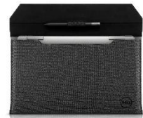
Dell Premier Sleeve - XPS 13