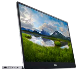
14" Portable Monitor - C1422H

Laptop docking station with a wireless charging stand for Qi-enabled smartphones or earbuds.