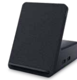
Dell Dual Charge Dock - HD22Q

Elevate your video conferencing experience on this powerful, intelligent 4K webcam 42 that optimizes your visuals with a large 4K Sony STARVIS™ CMOS sensor and AI Auto-Framing.