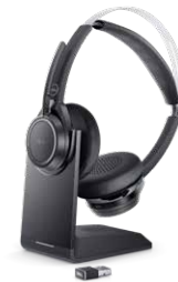
Premier Wireless ANC Headset - WL7022

Multi-task seamlessly across 3 devices with this premium full-size keyboard and sculpted mouse combo featuring programmable shortcuts and 36 months battery life. 43