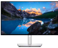
UltraSharp 40 Curved WUHD Monitor - U4021QW

Redefine productivity on this 40" curved ultrawide WUHD 5K2K monitor that delivers exceptional color and clarity.