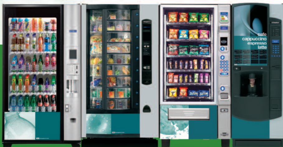
Image shows BevMax 4 35 select, Shopper 2, Merchant 4 & Evolution. Base graphics shown on Merchant and Evolution are available as extra cost options.

Place the Shopper 2 with snack, combination and drinks machines from the Crane Merchandising Systems range to create a total vending solution tailored to the needs of specific staff/customer preference or location.