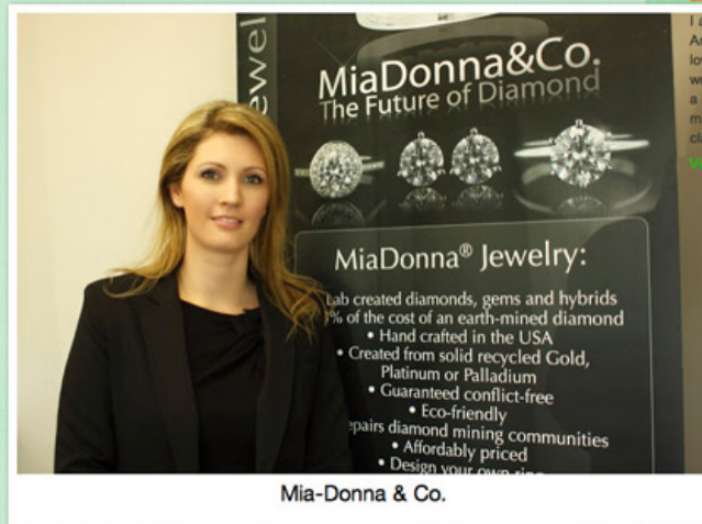
Mia-Donna & Co.

Welcome to the third sustainable jewelry digital storytelling review. There are many paths to creating a more sustainable world. Let this blog entry inspire your involvement toward building a better future for all!