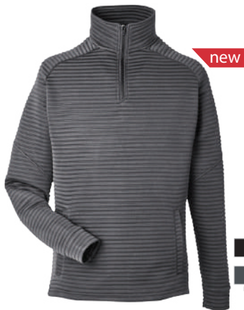
S16640 MEN'S CAPTURE QUARTER-ZIP FLEECE • 100% polyester bonded knit with polyfill channels • reverse coil quarter zipper with Spyder logo zipper pull • Spyder branding on back neckline • embroidered iconic Spyder bug logo on left sleeve SIZES: S-3XL