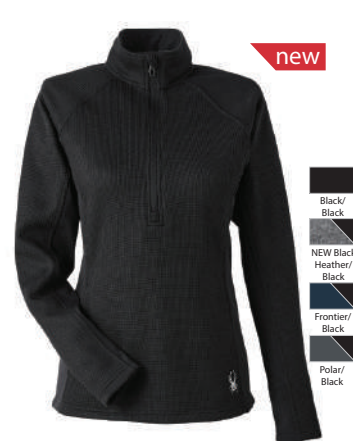
S16562 LADIES' CONSTANT HALF-ZIP SWEATER • 100% polyester sweater knit bonded to fleece- 340 GSM • customer Spyder knit jacquard • brushed micro-denier tricot inner collar • stretch fleece panels at underarm and side body • hidden on-seam front pockets • princess seam details • Spyder branding on back neckline • iconic Spyder bug logo on front left waist SIZES: XS-2XL