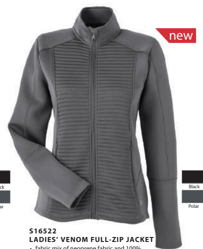
S16522 LADIES' VENOM FULL-ZIP JACKET • fabric mix of neoprene fabric and 100% polyester bonded knit with polyfill channels • active fit • dye-to-match front zipper with reflective tape • princess seam details • zippered front pockets • Spyder branding on back neckline • iconic Spyder bug logo on left bottom hem SIZES: XS-2XL