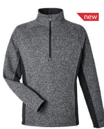
S16561 MEN'S CONSTANT HALF-ZIP SWEATER • 100% polyester sweater knit bonded to fleece- 340 GSM • customer Spyder knit jacquard • brushed micro-denier tricot inner collar • stretch fleece panels at underarm and side body • hidden on-seam front pockets • Spyder branding on back neckline • iconic Spyder bug logo on left bicep SIZES: S-3XL