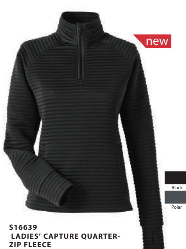
S16639 LADIES' CAPTURE QUARTER-ZIP FLEECE • 100% polyester bonded knit with polyfill channels • dye-to-match quarter zipper with reflective tape • reverse coil center front zipper with Spyder logo zipper pull • Spyder branding on back neckline • embroidered iconic Spyder bug logo on left sleeve SIZES: XS-2XL