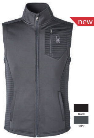
S16538 MEN'S VENOM VEST • fabric mix of neoprene fabric and 100% polyester bonded knit with polyfill channels • invisible seam front pockets • Spyder branding on back right shoulder • iconic Spyder bug logo on front left zipper chest pocket SIZES: S-3XL