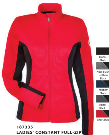
187335 LADIES' CONSTANT FULL-ZIP SWEATER • 100% polyester sweater knit bonded to fleece- 340 GSM • customer Spyder knit jacquard • brushed micro-denier tricot inner collar • active fit • reverse coil center front zipper • princess seams for a feminine silhouette • zippered hand-warmer pockets inset into princess seams • Spyder branding on back right shoulder • iconic Spyder bug logo on left bicep SIZES: XS-2XL