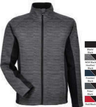
187330 MEN'S CONSTANT FULL-ZIP SWEATER • 100% polyester sweater knit bonded to fleece- 340 GSM • customer Spyder knit jacquard • brushed micro-denier tricot inner collar • active fit • reverse coil center front zipper • raglan sleeves • zippered hand-warmer pockets • Spyder branding on back neckline • iconic Spyder bug logo on left bicep SIZES: S-3XL