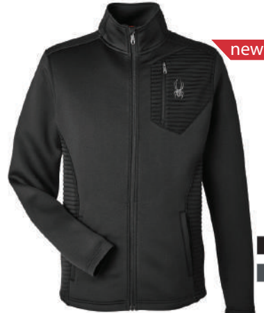
S16539 MEN'S VENOM FULL-ZIP JACKET • fabric mix of neoprene fabric and 100% polyester bonded knit with polyfill channels • reverse coil center front zipper with Spyder logo zipper pull • Spyder branded zipper closer on chest pocket • Spyder branding on back right shoulder • iconic Spyder bug logo on front left-chest pocket SIZES: S-3XL