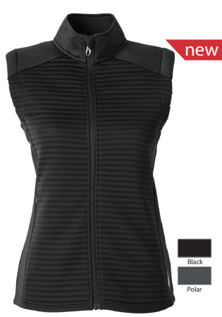
S16523 LADIES' VENOM VEST • fabric mix of neoprene fabric and 100% polyester bonded knit with polyfill channels • active fit • reverse coil center front zipper with Spyder logo zipper pull • princess seam details • invisible seam front pocket • Spyder branding on back neckline • iconic Spyder bug logo on left bottom hem SIZES: XS-2XL