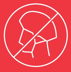
THE FOREHEAD IS EXPOSED. COULD CAUSE SERIOUS INJURY.