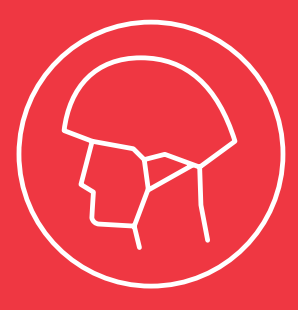
THE FOREHEAD IS COVERED BY THE HELMET.