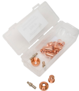
ITEM# 85677 40 P Plasma Parts Kit Max Performance