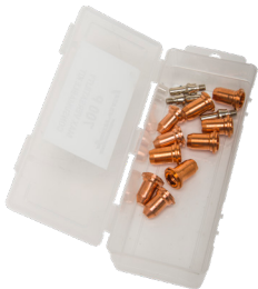
ITEM# 85676 40 P Plasma Parts Kit Max Versatility