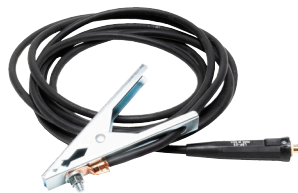
ITEM# 85667 Ground Cable Assembly 150A