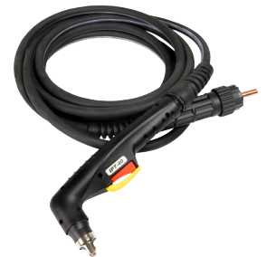
ITEM# 85680 Plasma Torch