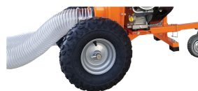
ATV-LOCKING WHEELS OFF-ROAD ONLY