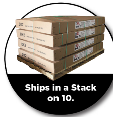
Ships in a Stack on 10.