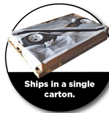
Ships in a single carton.