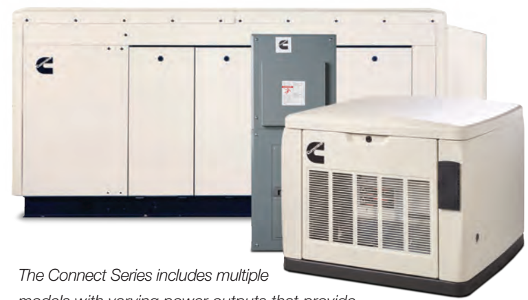
The Connect Series includes multiple models with varying power outputs that provide reliable backup, regardless of your power needs. An Automatic Transfer Switch (ATS) is also available.

The Connect Series puts almost 100 years of proven Cummins reliability into a range of powerful backup solutions. Featuring advanced technology and design for nearly any home, large or small, these quiet, compact generators allow your life to go on normally even during an outage.