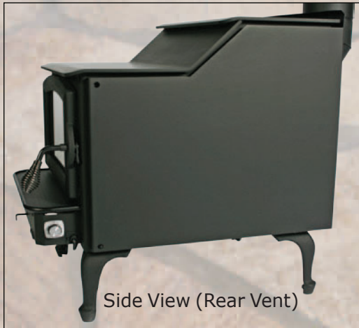
Side View (Rear Vent)

The Model 261 is a prime example of the style and elegance of a Buck Stove. This unit can heat up to 1800 square feet. The Model 261's venting technology allows venting from the top or rear of the unit. Optional 2" legs are available. This model is approved for mobile home use.