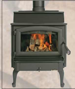
Front View (Top Vent)