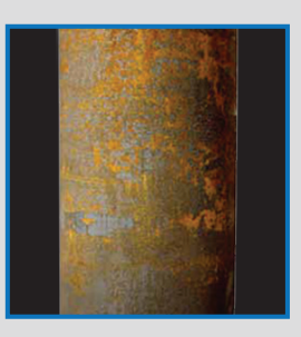
Top Competitor Glass-lined Tank Very Heavy

Minimizes Scale Build Up Prolongs Tank Life Lightweight Construction