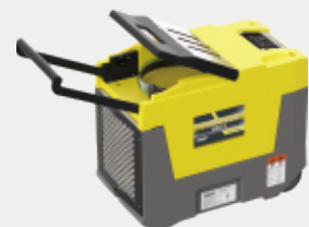
Fold- Down with Wheels for Transport

This is a very compact dehumidifier that is produced for drying restoration. This unit features a portable design for easy transportation. It's stackable design can not only save the flood restorer more space but also make more numbers of the Units that have been transported to the destination for after flood restoration tasks.