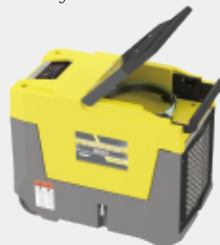
Easy Cord & Hose Storage