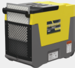
Easy Filter Access