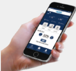
Smart Wi-Fi / APP Control

the savings from using thermostats instead of air conditioning. Once you are able to maintain a consistent relative humidity of 50% or less, you will no longer have to keep the thermostat at low, uncomfortable temperatures once used in an effort to control humidity.