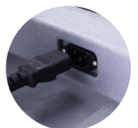
Quick power cord connection