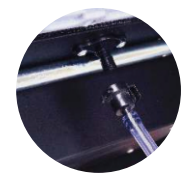
Quick draining connection