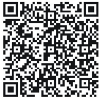
Iphone Code Video