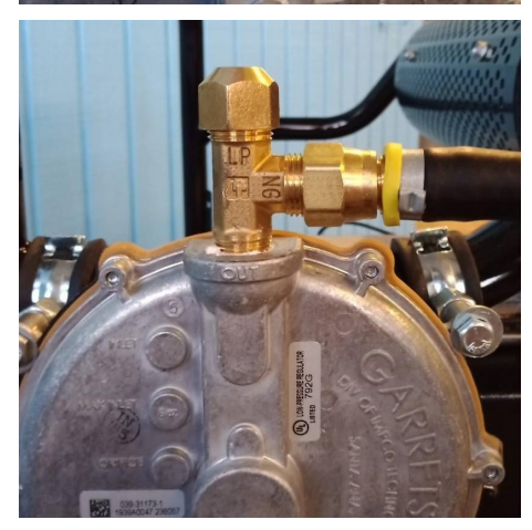
2. Connect and tighten the fuel hose fitting to the proper outlet.