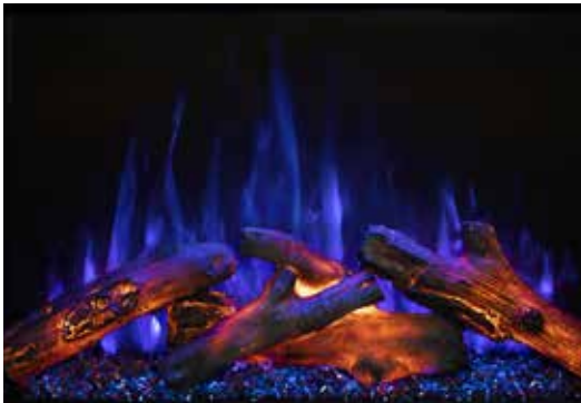
Blue Flames - Logs on

Flame & Ember Bed Colors Controlled Independently