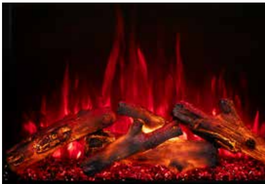
Red Flames - Logs on