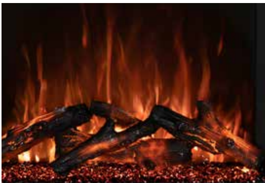
Orange Flames - Logs on