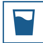
Chlorine Taste & Odor