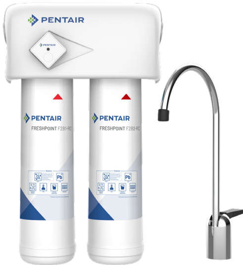
F2000-B2M, (with filter life monitor) shown